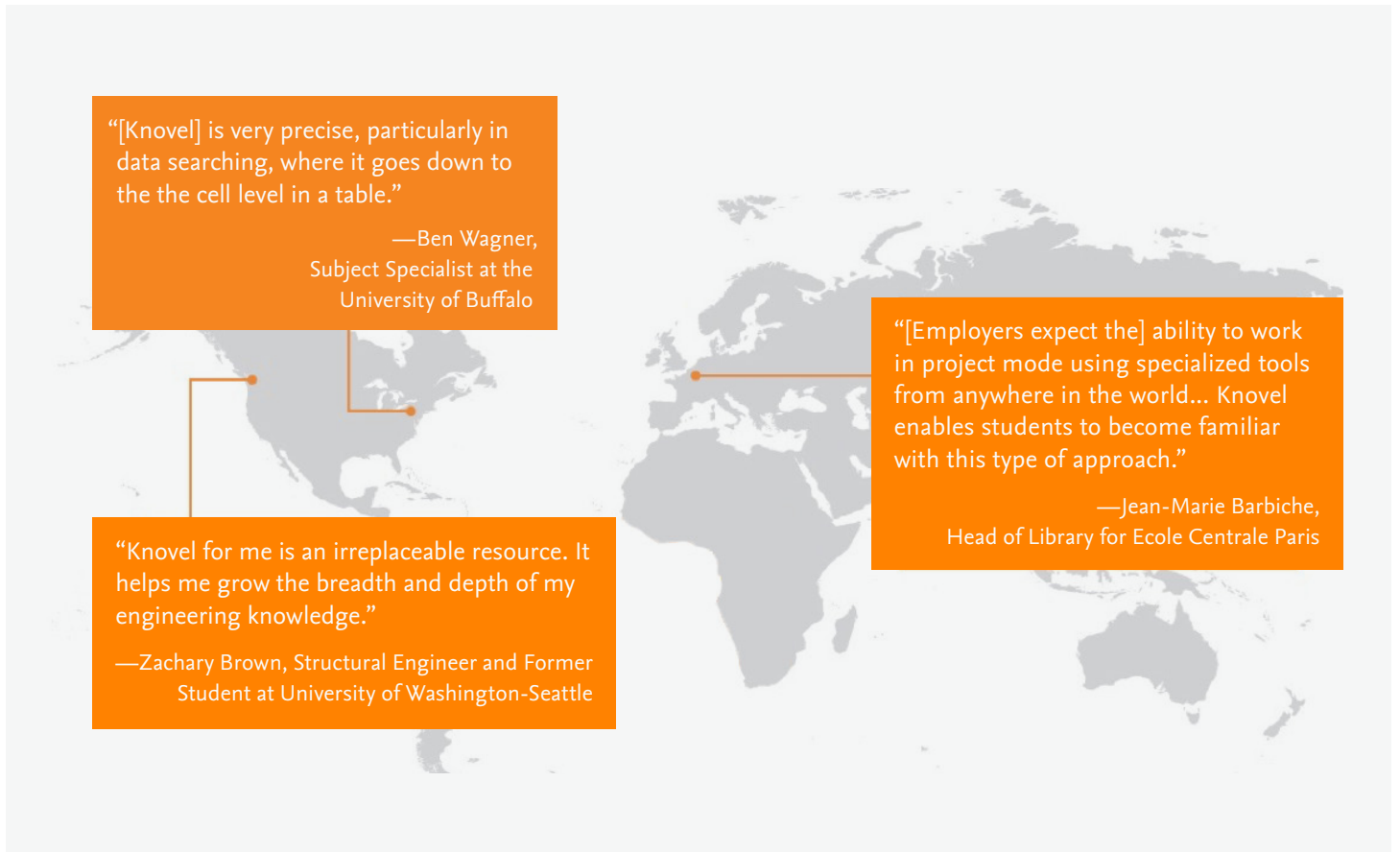
Figure 1: Knovel has proven essential for companies across industries and gives young engineers an upper hand as they move into the workforce.